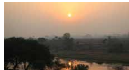
Morning sunrise at Kosish the Hospice

hours. Her death came quickly in the end. Her funeral and cremation was held on 18th December 2015. The final 6 months of 2015 will always remain as a significant period in my life. I include this personal detail in the hope that those reading this appreciate that as health professionals working so closely with the terminally ill and with the elderly, we too have personal lives, families and loved ones for whom we care. We do need to balance our own care as we offer care to our patients and clients as well as to our own loved ones.