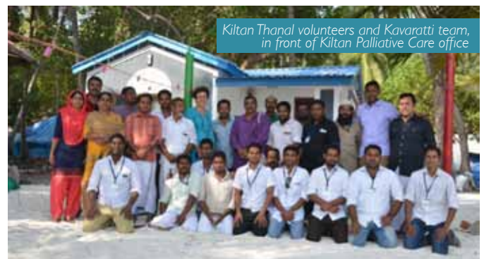
Kiltan Thanal volunteers and Kavaratti team, in front of Kiltan Palliative Care office

We are reminded that palliative care is a philosophy of care that extends beyond walls, beyond diagnoses, beyond professional labels and hierarchies, beyond medicines, equipment, services, beyond ourselves. Yes, many of the home care patients visited are bedridden living with chronic illness, subarachnoid or CVA-induced hemiplegia, bronchiectasis, encephalopathy with spasticity. But in a setting without home care services of any type, this is the need. The team dress pressure ulcers, check blood pressures, urinary catheters, Ryles's tubes, tracheostomy tubes, contractures, hygiene and diet. They encourage and support the carers, mostly women, who are providing most of the hands-on care. Their visits reduce the loneliness of patients and carers alike.