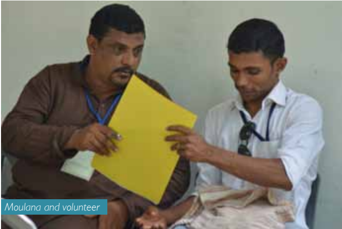
Moulana and volunteer

I hope you will let me tell you a story about Lakshadweep, a group of islands in the Arabian sea, off the coast of Kerala, India.