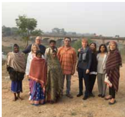
Ready to depart Kosish the Hospice after a wonderful cultural exchange of contexts, conversations and compassion

can. It's one thing to provide palliative care where resources and funding are readily at hand even when such funds may be limited. It's a whole different challenge attempting to educate for, and to advance palliative care services to those living in poorer remote and rural regions of India wherein access to medical resources is extremely compromised.