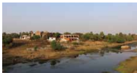
Kosish the Hospice in February 2016

an essential professional responsibility so as to ensure we can 'be present' for and with others. The opportunity to participate in a first ever 'Self-Care Retreat at a Hospice' in India piqued my interest and felt like a balm for my soul.