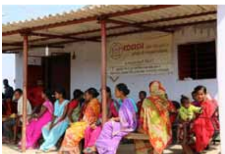
Sunday – local villagers attending the free weekly clinic mostly for women and the elderly.