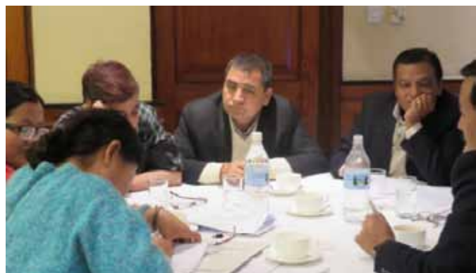
Delegates deliberate as they discuss issues regarding a Palliative Care Strategy for Nepal