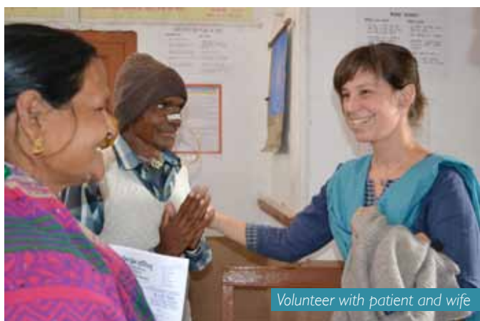
Volunteer with patient and wife

Ganga Prem Hospice is a spiritually orientated, non-profit hospice for terminally ill cancer patients which currently offers home care to the districts of Rishikesh, Haridwar and Dehradun in Uttarakhand, North India. The Hospice provides medical, social, emotional and spiritual support for individuals and their loved ones facing life threatening cancer. Currently Ganga Prem Hospice is building an inpatient unit near Rishikesh. It is due to open in 2016. The hospice places a great significance on all dimensions of care in particular the dimensions of spiritual care to ensure holistic treatment.