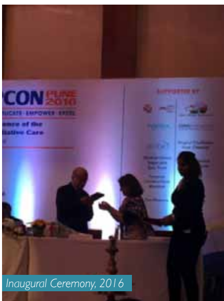
Inaugural Ceremony, 2016