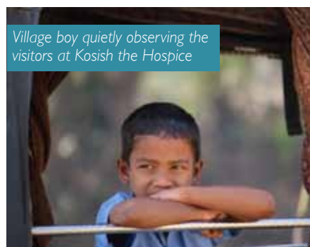
Village boy quietly observing the visitors at Kosish the Hospice

Existential psychotherapist, Dr Irvin Yalom (1998) comments, '...this approach, "existential psychotherapy," defies succinct definition, for the underpinnings of the existential orientation are not empirical but are deeply intuitive'. Yalom clearly explains his definition: 'Existential psychotherapy is a dynamic approach to therapy which focuses on concerns that are rooted in the individual's existence' (1998, 170). Thus each person's process of dying and their moment of death form an essential part of their unique existence. I carried within me the notions proposed by Yalom that there are four ultimate concerns each individual will face at various times in their life. The four ultimate concerns include: death, freedom, isolation and meaninglessness. All four of these ultimate concerns are not only associated with end of life but may present during any of life's challenging events. Our precious time spent at this inaugural Self Care Retreat provided ample opportunities in a quiet place and in a slowed down pace, to contemplate and share engaging conversations indirectly discussing these four ultimate concerns. In particular to consider these within the poignant context of India – a country possessing a myriad of diverse contrasts was food for our souls.