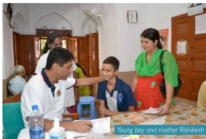
Young boy and mother Rishikesh